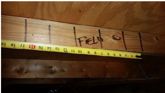
Roof deck nail spacing - Field