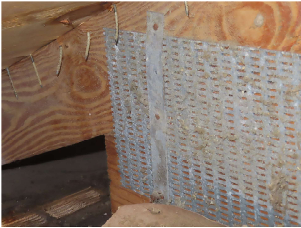
Roof to wall attachment - Clips