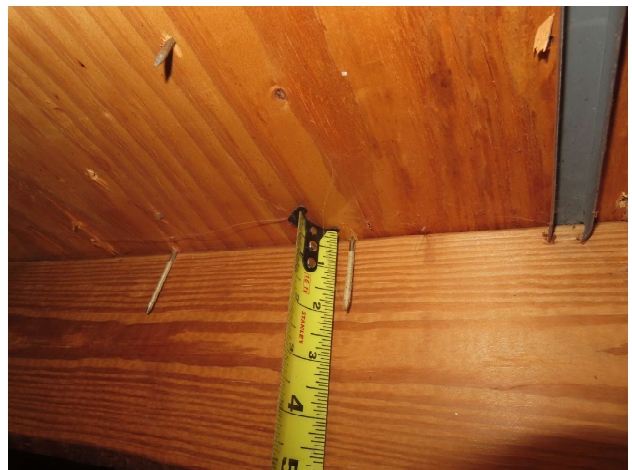
Roof deck attachment - 8d nails